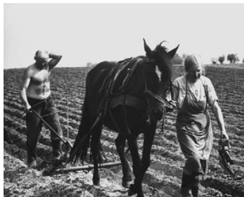
Polish Farmers.