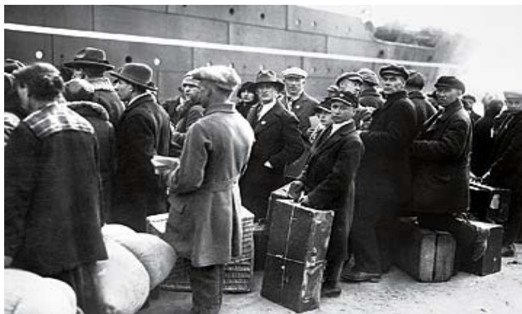
Polish Immigrants waiting in line to have their passports checked before leaving. Warsaw, Poland, 1927.

The city of South Bend has a very diverse ethnic background. The history of this small Midwestern city chronicles both opportunity and depression, community building and segregation, development and disarray. After the first wave of immigrants arrived in the late 19 th century, many groups continued to call this part of northern Indiana home. Apart from the French Holy Cross missions, which were instrumental in organizing the first communities here in Indiana, South Bend's ethnic heritage is mostly Eastern European. Hungarians, Slavs, Germans, and Irish made their way to this part of the Midwest because of economic opportunity in the manufacturing industry. The Poles were one of the first groups to arrive in South Bend, forming a prominent ethnic contingency that would become intimately interwoven with the history and culture of this industrial