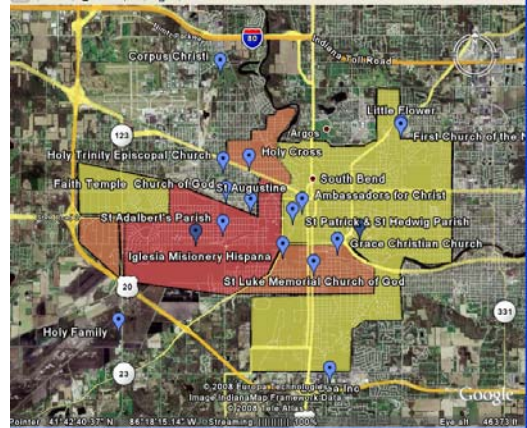
A map of the predominant Hispanic parishes in South Bend. Notice the overlap with the previous Polish community. Higher densities are indicative of higher populations. Adapted from Kimberly Tavare, Jenna Adsit and Emilie Prot, 2006.

Hispanics occupying 3.3% of total jobs; in 2006 construction work predominated with 10.9% of total jobs (Indiana, 2007).