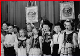
Immigrant Children singing. Detroit Michigan, 1955.

The 1950's, although prosperous for the Polish community, showed plateaus in church membership and business development. It was becoming apparent that South Bend Polonia had reached the end of its golden age in the 1950s and was beginning to feel the effects of assimilation.