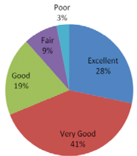
Health status: Hispanics in Indiana